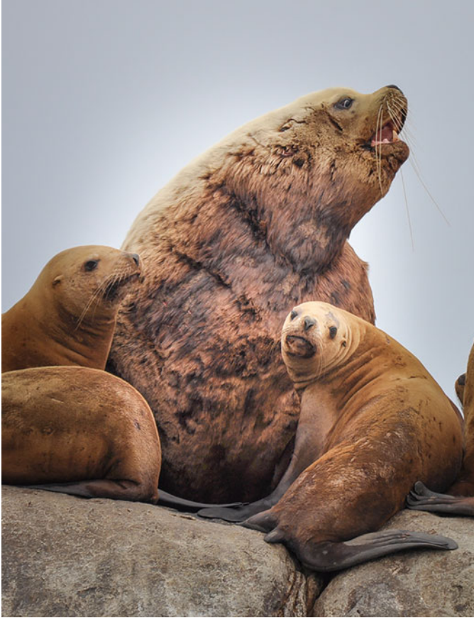
Fig. 23.7 A scarred Steller sea lion bull weighing over 700 kg among young females

Hastings et al. 2011; Maniscalco et al. 2015). The longest Steller sea lions might live (i.e., longevity—defined as the oldest age attained by <1% of the population) is about 16 years old for males and 23 years old for females.