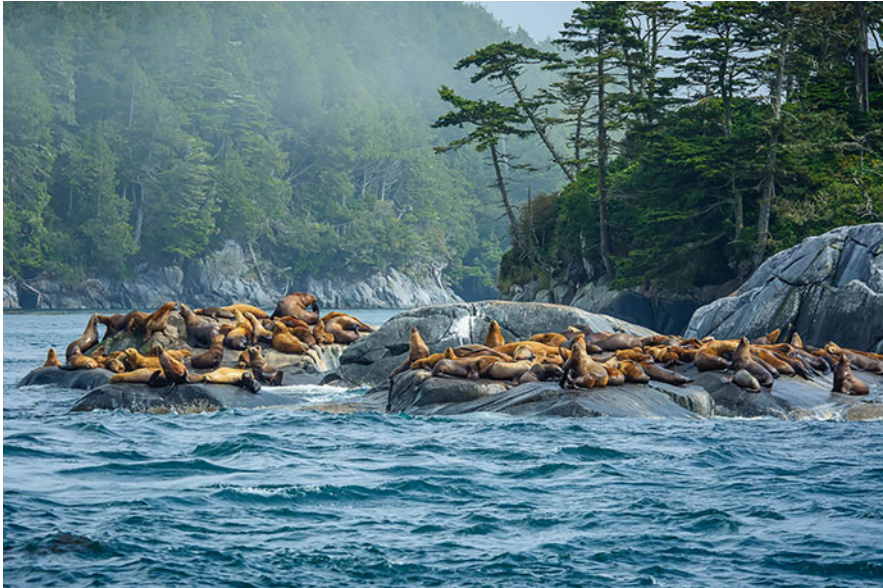
Fig. 23.6 A Steller sea lion haulout in British Columbia in August showing typical substrate and the presence of mostly mature and immature females, as well as a few bulls and dependent juveniles. The two pups (near the water edge, left side) would have swum over 100 km from the closest rookery with their mothers

behavior or provided baseline measurements that could be used to determine why the Western population of Steller sea lions was declining.