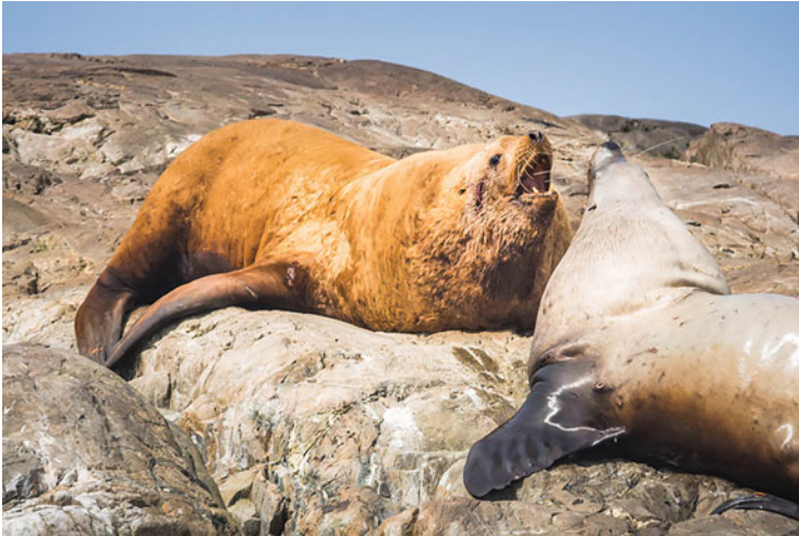
Fig. 23.8 Steller sea lion bulls making territorial displays towards each other. Note the scars on the face, chest and flippers from fights that involved hard bites and shaking. Note also the difference in color and texture of dry and wet pelage

This parabolic relationship between age of mothers and her date of parturition (Hastings and Jamison 2016) is consistent with the non-linear relationship between age of northern fur seal mothers and the size of fetuses they carry (Trites 1991). Fetuses of northern fur seals increase in size as mothers age until the females are 10–13 years, after which adult females continue to grow, but the sizes of their fetuses decline (Trites 1991). This suggests that timing of birth in Steller sea lions reflects the size of a fetus at term, with larger fetuses being delivered earlier on average than smaller fetuses. Male pups are heavier on average than female pups (Brandon et al. 2005; Merrick et al. 1995), which suggests that differences in body size may also explain the apparent difference in timing of male and female births.