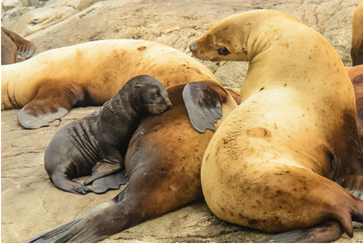
Fig. 23.9 A nursing Steller sea lion pup. Females have four or six functional teats, such as this female with six teats

2006). Typically, first time mothers (i.e., primiparous females aged 3–6 years) return to sea to feed before multiparous females—due perhaps to having a smaller body size with less body reserves than multiparous females to produce milk for their pups (Maniscalco et al. 2006; Hastings and Jemison 2016).