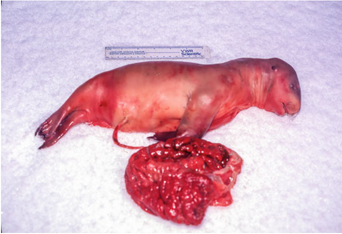
Fig. 23.10 An aborted Steller sea lion fetus found on a haulout during January. Photographed on snow with a 15 cm ruler for scale

1982). The highest frequency of abortions occur from January to March during the second trimester of pregnancy when the fetus is about 2–5 months developed. Fetuses collected and tested for disease known to cause abortions in mammals have not revealed underdevelopment or pathogen-related causes (Esquible et al. 2019; Burek et al. 2005). There is no medical explanation for the high frequency of abortions among Steller sea lions.