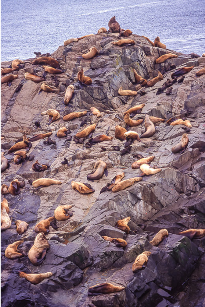
Fig. 23.5 A Steller sea lion rookery in Southeast Alaska in June showing typical substrate and the distribution of pups and adult females across the territories of four bulls

11 young sea lions shot at a small sea lion rookery. He also described how mothers attempted to carry their young to safety by biting onto the skin fold of the neck or rump of their pups. He further noted how the young followed their mothers into the water.