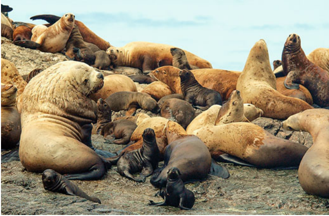
Fig. 23.4 A Steller sea lion bull in July with pups, a harem of adult females—and a dependent juvenile (upper right corner)

have been grouped into three populations or stocks—Russian, Western and Eastern (Baker et al. 2005). Despite their huge range, Steller sea lions only breed at about 100 sites (rookeries, Figs. 23.1 and 23.5) and rest at over 600 other sites (winter and year-round haulouts, Figs. 23.1 and 23.6) (Loughlin et al. 1992; Trites and Larkin 1996; Burkanov and Loughlin 2005; Olesiuk 2018). As noted by Georg Steller, the terrestrial sites used by Steller sea lions tend to be on relatively steep barren rocks and wave-cut outcrops associated with sheer drop offs (Ban and Trites 2007). Most of their terrestrial sites have been continuously used for centuries (Lyman 1988; Steller 1751) and tend to be exposed to ocean swells, with limited protection (Bigg 1985). While some haulouts are on steep cobblestone beaches, most are characteristically on solid stone from which the sea lions can quickly enter deep waters. The consistency with which they have repeatedly used so few sites over centuries (Lyman 1988) suggests that Steller sea lions have a fairly narrow set of criteria for haulout selection throughout their range—from California to Japan.