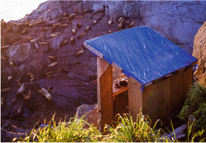
Fig. 23.3 An observation blind used by Milette and Trites (2003) to record perinatal periods and duration of foraging trips of Steller sea lions breeding on Lowrie Island (Forester Island complex) in Southeast Alaska

patterns of sea lions at their breeding (rookery) and resting (haulout) sites from blinds (Fig. 23.3) and through remotely operated cameras. Interactions between mothers and their dependent young were particularly noteworthy to determine the weaning process and the perilous time of year when young sea lions might be dying. Collectively, behavioral studies yielded critical pieces of new information about the life history of Steller sea lions. They also revealed much about the plasticity of sea lion behavior and the ability of Steller sea lions to adapt to changes in their environment. More importantly, behavioral observations provided significant insights needed to resolve why Steller sea lions had declined.