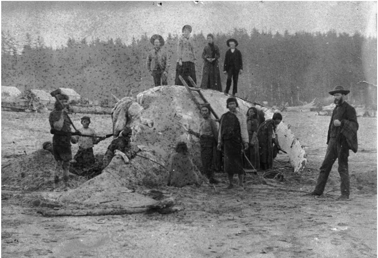
Figure 3: Butchering a humpback whale on the beach at La Push, the Quileute Reservation. Note the ropes on and around the whale and the flensed tail flukes of the animal. These are good indications that this was a hunted whale rather than a stranded animal. Whale flukes would have cut to decrease drag while towing the whale back to shore—this is a practice that is still used today by some Inupiat whalers in Alaska.

available whales over gray whales. Gray whales were also reported to be more ferocious than humpbacks (Kirk 1986)—an observation echoed by contemporary Alaskan and Chukotka indigenous whalers. The similarities between the Ozette and La Push middens thus suggest a preference for humpback whales. However, further archaeological analysis is needed to more conclusively identify whale remains to species at La Push and other Quileute village sites.