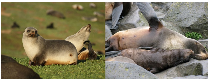
FIGURE 1 Antarctic fur seal female on Pointe Suzanne colony, Kerguelen Island, Southern Ocean (left), and northern fur seal female with pup on Reef rookery, St. Paul Island, Bering Sea (right) during their respective breeding season

The objectives of this study were to develop a method to estimate activity-specific metabolic rates in wild free-ranging animals in connection with their detailed time–activity budgets. We used northern and Antarctic fur seals—two sub-polar species with similar physiology, biology, behavioral ecology, and reproductive strategy that have evolved in environments with similar features (Gentry & Kooyman, 1986) as biological models (Figure 1). The first step of our method requires implementing a decision tree algorithm to partition the time spent by individuals in different at-sea activities (sleeping, diving, transiting, and resting) using fine-scale data collected by biologging devices. The second step derives activity-specific metabolic rates based on precise time–activity budgets and total at-sea metabolic rates measured with a traditional and established method (DLW). We aimed to develop an energetic framework to estimate activity-specific metabolic rates that can be applied to other marine and terrestrial species in hopes of furthering understanding of the interconnections between behaviors, energetics, and fitness—as well as providing a tool that can be used for conservation purposes to assess the consequences of environmental changes on foraging ecology, and help determine the underlying causes of population changes.